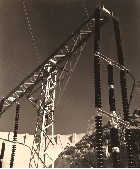
Charles Sheeler, Boulder Dam – Transmission Towers , 1939, Museum of Fine Arts, Boston

achieve the value and importance of his paintings when she sold 2,500 photographs to collectors William and Saundra Lane, with the understanding that they be kept from the public eye until the appropriate moment. The Lanes eventually gave the photographs to the Museum of Fine Arts, Boston.