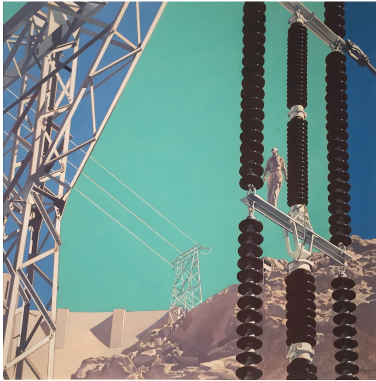
Charles Sheeler (1883-1965), Hydro Electric Power, Hoover Dam , 1950, tempera and ink on paper board, 14 ½ x 14 ½ inches

Hydro Electric Power, Hoover Dam , 1950, was not the first time Charles Sheeler had addressed the subject of the Hoover Dam. In the fall of 1939, Sheeler visited the Hoover Dam and painted the closely related Conversation—Sky and Earth , 1940 as part of a Fortune magazine commission to illustrate the concept of power through American technology marvels. He returned to his image of the Hoover Dam ten years later to produce Hydro Electric Power for the February 1951 cover of Reader's Digest .